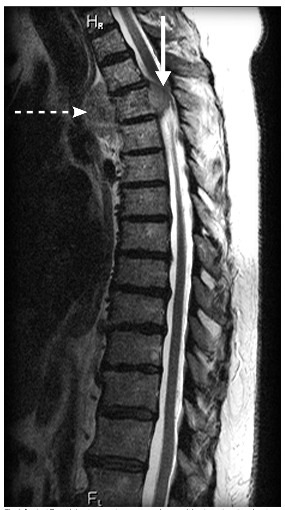
Fig 3 Sagittal T2 weighted magnetic resonance image of the thoracic spine showing a tumour mass in the upper thoracic spinal canal (solid arrow) and in the prevertebral region just in front of the spine (dashed arrow). The spinal canal component is causing compression of the underlying spinal cord.